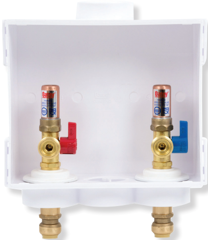
US Patent #6,155,286

The Quadtro offers one design for every installation